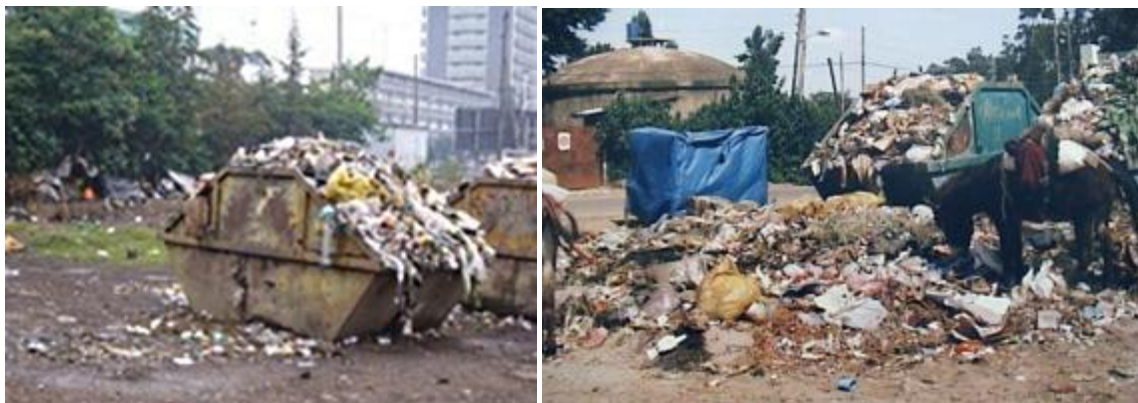
Photo 2 a & b Filled solid waste containers

Waste collection in Ethiopia is mostly restricted to urban areas. The following analysis is based on Addis Ababa, though the levels of organization and infrastructure vary between cities. 16