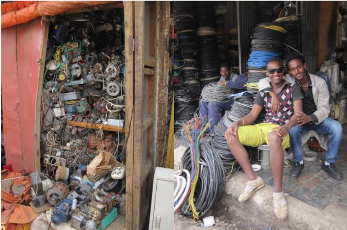
Photo 5 a & b Shops dealing with used EEE in Merkato Market, Addis Ababa