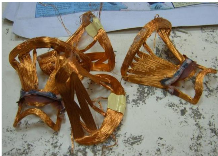
Photo 7 Pure copper retrieved from the yokes of CRTs