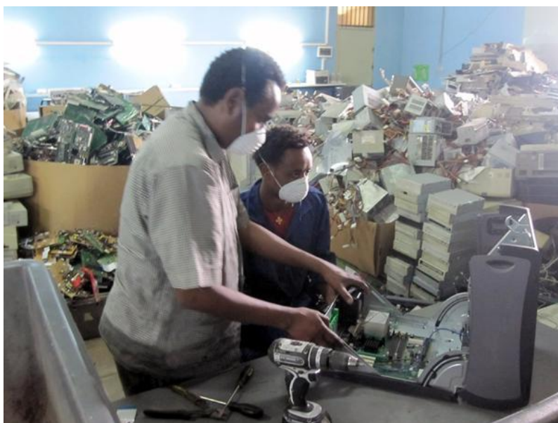
Photo 4 Computer dismantling in the Demanufacturing Facility in Akaki