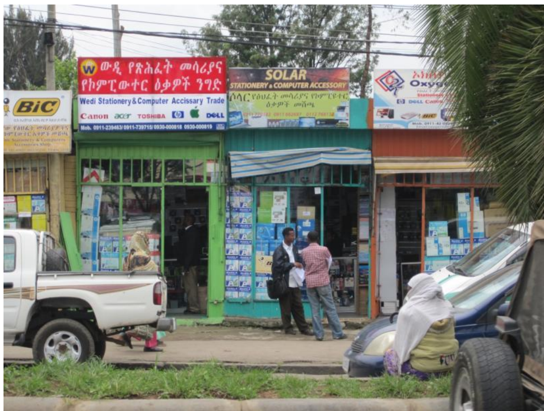
Photo 1 Electronic equipment retail shops in Kazanchis, Addis Ababa

over urban Ethiopia. In Addis Ababa, one major distribution cluster is located in the Kazanchis area, where more than 100 shops sell new and used electronic products such as printers, copy machines, computers and mobile phones.